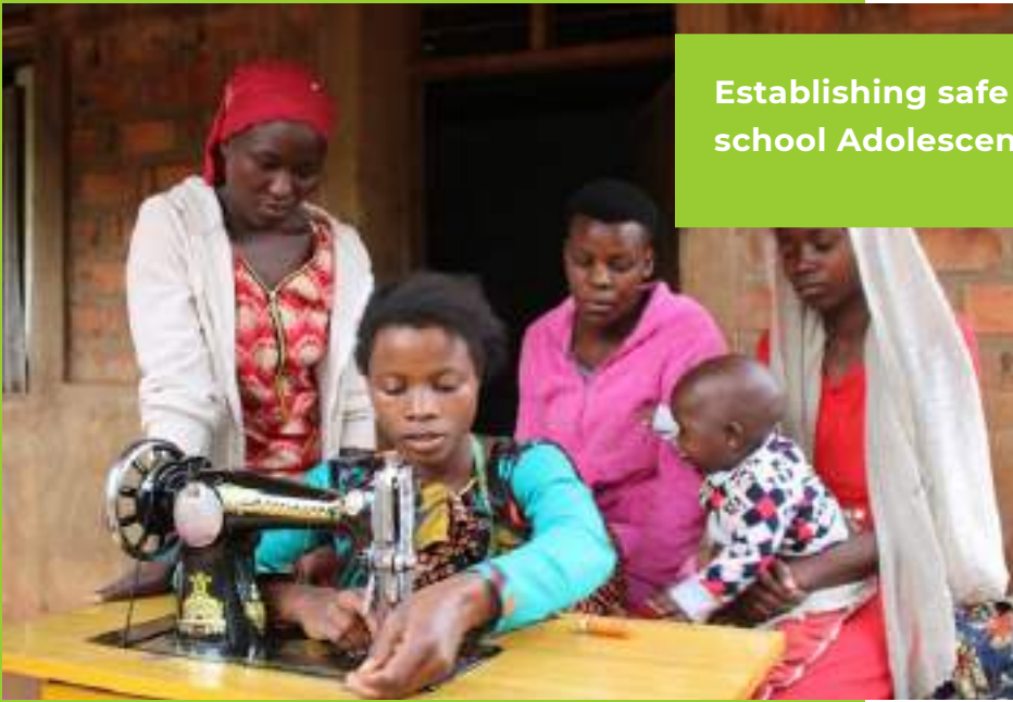
Establishing safe spaces for out of school Adolescents