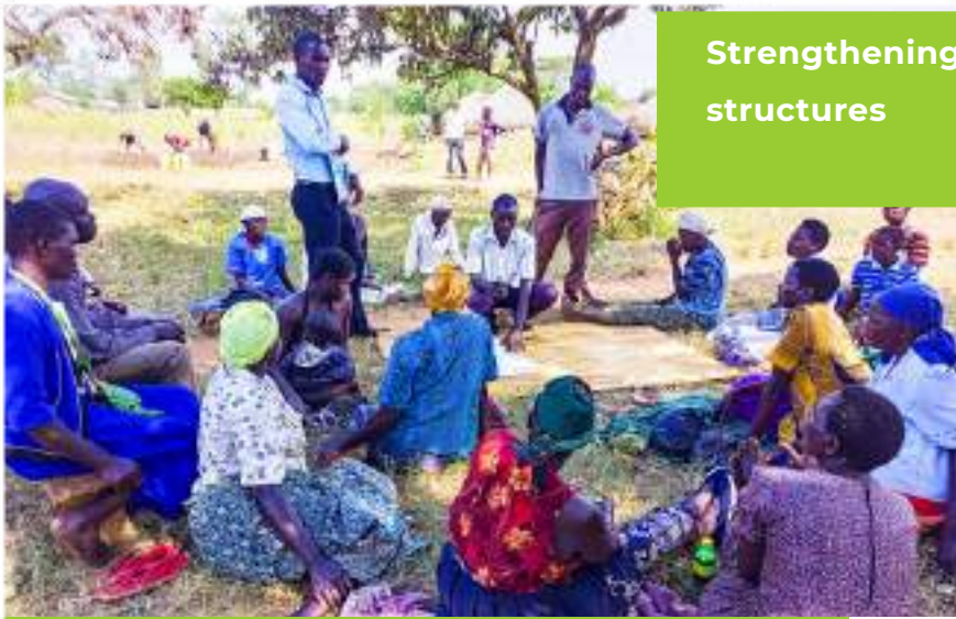
Strengthening informal and formal structures